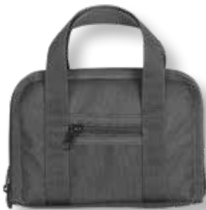
680-1 small - 20 x 14 cm