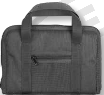
680-2 medium - 26 x 18 cm