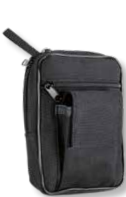
286-1 small - 12 x 16 cm