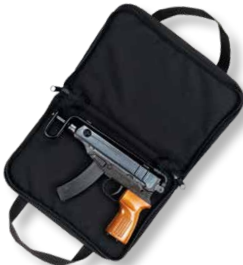
680-3 large - 30 x 20 cm