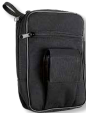
286-2 large - 14 x 20 cm