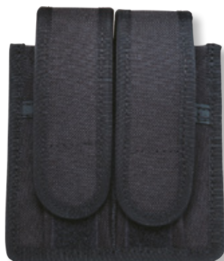
268/MS Universal double magazine pouch