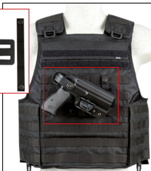
786/MS MOLLE pistol adapter