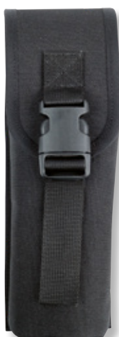
797/MS Holster for PYROCOOL