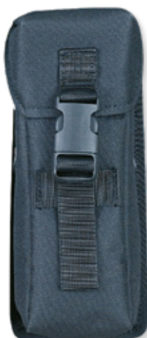
518/MS Double magazine pouch SA-58, HK G-36, HK G-35