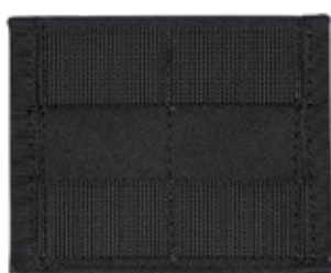
785/MS MOLLE belt adapter