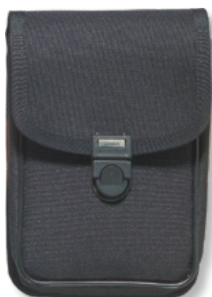
800 A/MS CASES FOR DOCUMENTS with bag lock 13 x 16 cm