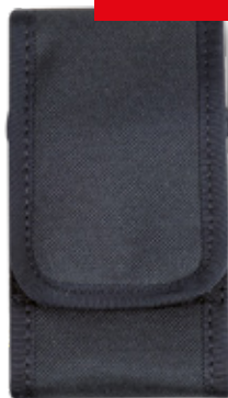
807-2/MS Etui for mobile phone 9 x 15 cm