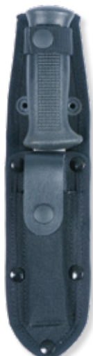
247p/MS Combat knife pouch