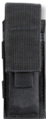
788/MS Magazine pouch