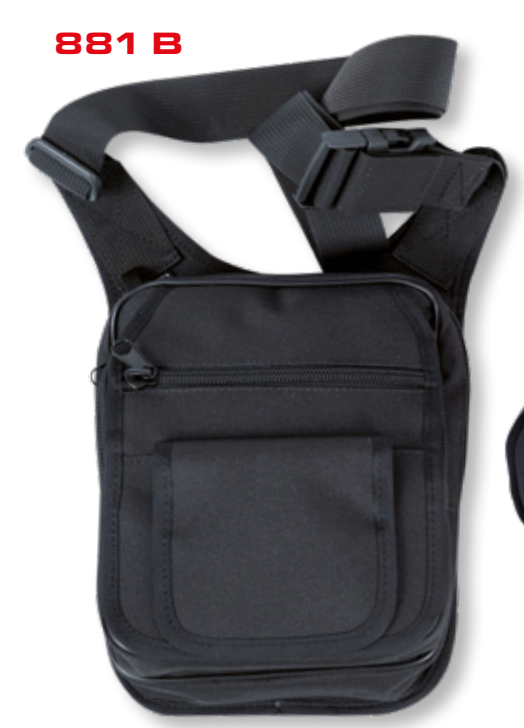
Arms etui vertical with rig over shoulder 18 x 23 cm

882\ \text{has} one over-the-shoulder carrying strap. The etui is intended for concealed weapon carry across the chest.