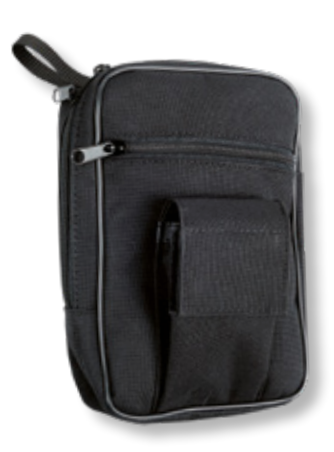
286-2 large - 14 x 20 cm