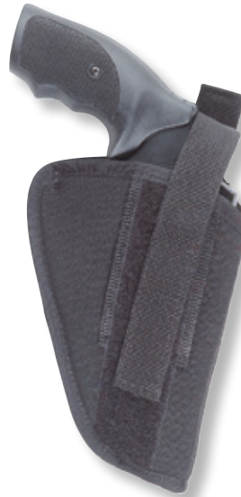
627 revolver 4"

■ Comfortable use for both right and left handers