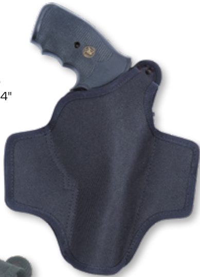
284 revolver 4"