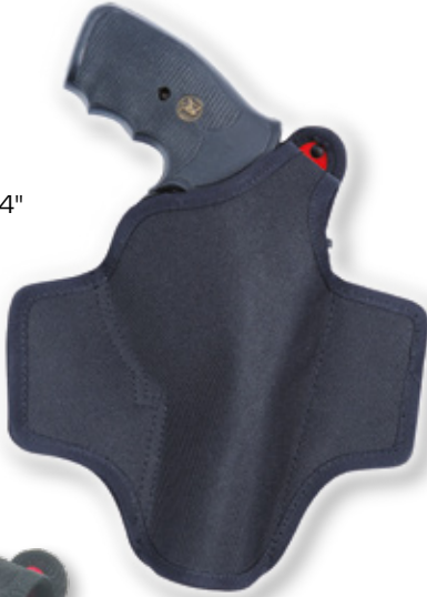
284 revolver 4"